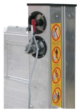
Detachable 2-button remote control and safety key control